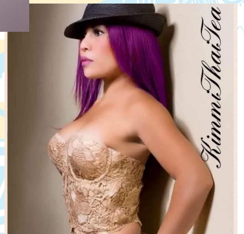
Kimmi Thai Tea